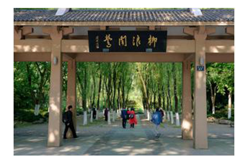
Figure 1 Orioles Singing in the Willows, West Lake

Lake also plants osmanthus and other fragrant plants to create a delightful scene known as the "Osmanthus in Autumns and Lotus Flowers for Ten Miles," a subject of praise by renowned poets such as Liu Yong. It is evident that the creation and integration of the three-scape contribute to the continuous allure and international fame of the West Lake landscape, making it a shining symbol of beauty both at home and abroad.