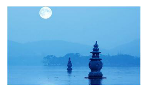
Figure 2 Three Pools Mirroring the Moon, West Lake