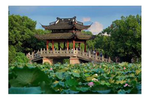
Figure 3 Quyuan Fenghe, West Lake