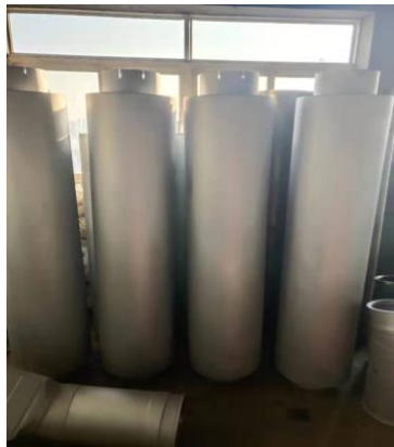
Figure 6 Silencer

Resistance silencer, the straight tube multi-chamber structure is suitable for large smoke flue, its principle is the use of porous and related sound-absorbing materials to reduce the noise, in the process of acoustic transmission, the pipe cross-sectional area or internal resonance chamber can cause the change of acoustic impedance, sound energy reflection and consumption, sound absorption material fixed in the smoke circulation wall or the resonance chamber, when the sound wave into the silencer, part of the sound energy in the pores of the porous material and friction into heat dissipation, sound wave weakened. The muffler has a good effect on high frequency noise. The internal material is 2 mm thick high temperature resistant, corrosion resistance metal plate, the surface is perforated