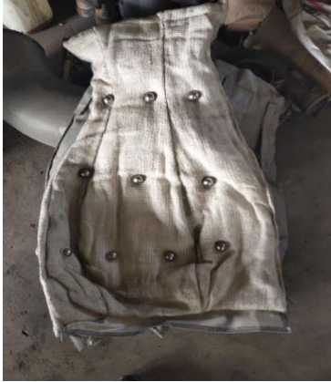
Figure 5 Fire protection cloth