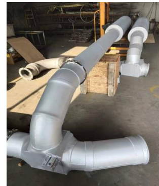
Figure 3 Physical drawing of reversing room

L_{\text{Through}}=430 mm, a leaf surface valve device is designed and installed at the rear end and the vertical end of the three links. The external control mechanism can effectively drive the valve to rotate 360^\circ , and the leaf surface can open or close the channel with the rotation, so as to achieve the purpose of changing the direction of smoke exhaust fluid. ③90° bent smoke exhaust pipe, the main function is to change the three-way vertical end direction to the silencer, so that the smoke exhaust direction changes from vertical to horizontal to right. Its design parameters are: bending angle DOB value is 90^\circ , space angle POB value is 283^\circ , and each diameter angle is the same as the above smoke exhaust pipe.