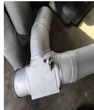
Figure 4 Overall physical drawing of row of smoke pipe